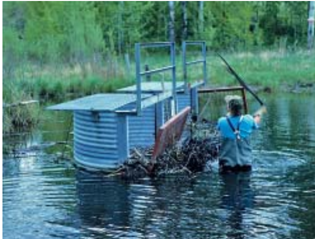
Cleaning a water control structure

volunteers). Management planning includes a review of historic vegetation communities and assessment of the feasibility of restoring habitat to historic conditions. Traditional recreational use is also reviewed to assess the feasibility of continuing or restoring traditional uses as part of the overall enhancement or restoration process, and to manage native and non-native species.