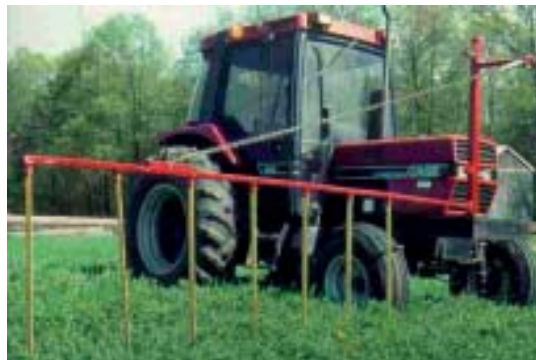
Tractor with flushing bar