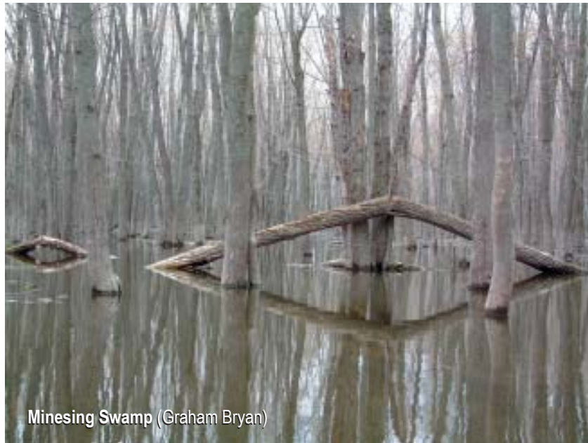
Minesing Swamp (Graham Bryan)

The Nature Conservancy of Canada and Nottawasaga Valley Conservation Authority marked the addition of 1,000 acres to Minesing Swamp. The secured area, almost 10,000 acres of which over 8,400 acres were secured by OEJV, now includes over 15,000 acres of world class wetlands. Partners who have supported the conservation of habitat include the Nature Conservancy of Canada, the Ontario Ministry of Natural Resources,