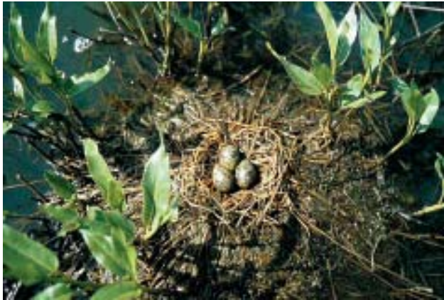
Black Tern Nest